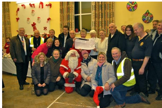
Picture taken at the Vernon Institute during the Christmas Lights Switch-On celebrations when we presented cheques to various organisations in the village.

We hope everyone admired the new sleigh which was built by school children from Ysgol Y Grango (Grange School) Wrexham, where one of our members is a teacher and supervised its construction. Not only did the pupils enjoy making the sleigh but it can now be used to raise funds for local causes and give so much pleasure to everyone who sees it.