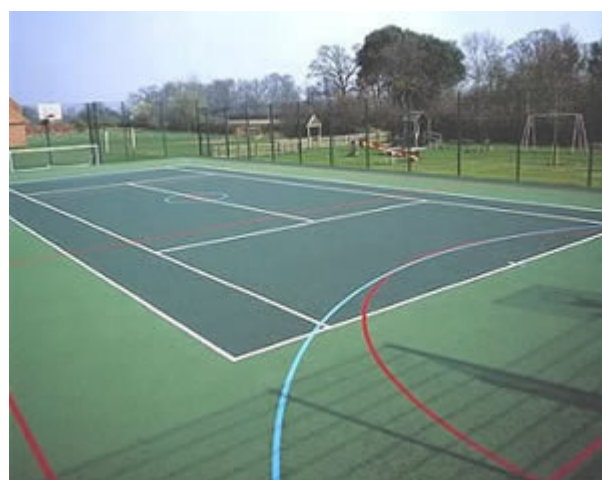
This picture is just an example of what the MUGA will look like.

As we reported in the last Newsletter, Leisure Surfaces, a company based in Hankelow near